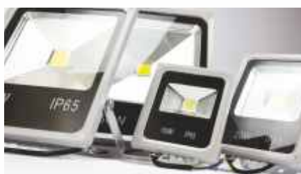
FLOOD LIGHT LED

Being one of the most celebrated Contracting establishments in Saudi Arabia, we provide the best street lighting service to each and every client. We are a combo of immense industry experience and resourcefulness. Our services contain installation of cable connection and erection of electrical poles for laying lighting network. The use of most modern technology and proficient team help us to maintain international standards.